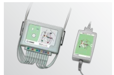
COSMED stress ECGs (wireless or patient cable)