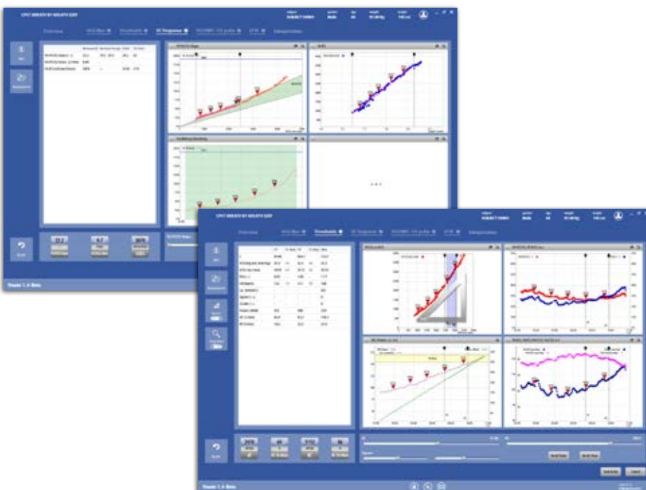
Powerful post editing for calculation and reviewing of main parameters (edit Thresholds, EFVL, \dot{V}E/\dot{V}CO_2 , etc.)