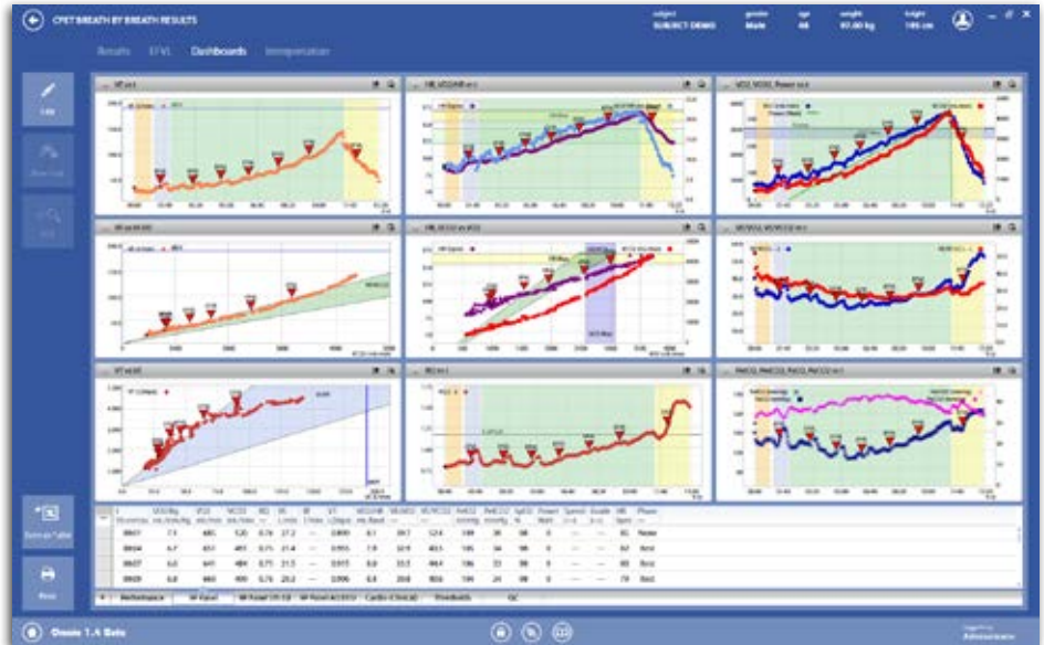
Possibility to manage/display in real time data and plots via dashboards (default and user defined)